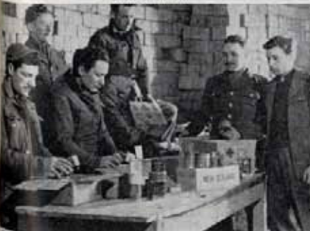
Examining New Zealand and American Red Cross packages in the Varlager.