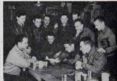
Prisoners study model planes made in the camp.