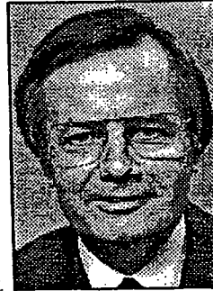
Journalist Bill Moyers will join 66 people touring European battle sites.

"Moyers wanted us to get as many veterans as possible who had never been back, so he could get