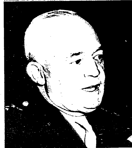
General Henry H. Arnold headed the Air Corps, which was then part of the Army.

Travelmasters International 1750 K Street, NW - Suite 510 Washington, DC 20006 (202) 463-4278