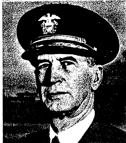
Admiral Ernest J. King was the exacting, hard-driving Chief of Naval Operations.