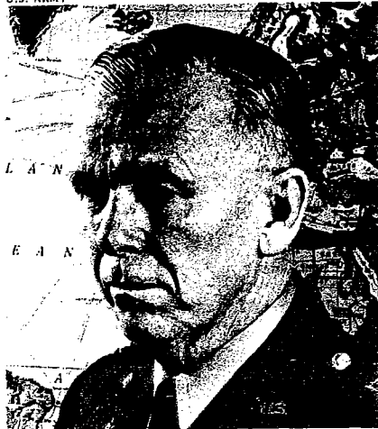
General George C. Marshall, Army Chief of Staff, was F.D.R.'s ablest strategist.