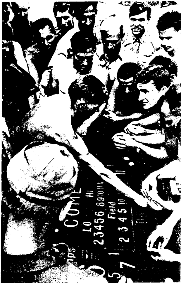
American prisoners of war at Sagan camp celebrate July 4, 1944, with a "bash" that featured gaming tables. The POWs could trade Red Cross cigarettes for gambling chips.

Their German captors called them Kriegsgefangenen – a tongue twister that the prisoners shortened to "Kriegie." The jaunty nickname belied the grim facts of POW life faced daily by the more than seven million men – American, British and Commonwealth, French, Polish and Russian – held by the Germans between 1939 and 1945. Barracks, often jerry-built, were freezing cold in the winter and stifling hot in the summer; food was meager and unappetizing.