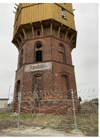
Szubin Water Tower circa 2020. Likely the first thing prisoners saw upon arrival

German guards. Conversations that would humanize the situation and perhaps (he hoped) would lead to better treatment and more rations. He found that walking was his best therapy so he would endlessly walk the perimeter of the camp. Almost two years of his life were spent here under conditions that Americans today cannot fathom or understand.