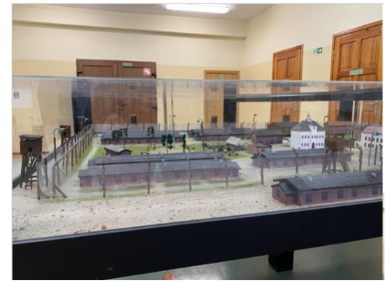
Model of Oflag 64 displayed at MOAS, a boys' school located on the former site of Oflag 64

line up them up and shoot them as the Russians got closer. They wanted to escape but had been told to not go east because the Russians would shoot them. However, after over two years of the Germans, they thought that they would rather be shot by the Russians on the move than be shot by the Germans up against a wall. They walked for three days and considered three different plans for escape. Opportunity then knocked on the door. The prisoners were put up in a big Polish farmyard for the night. Bob and three of his fellow officers got into a barn to sleep in the warm cow manure. They looked up and discovered that the hay loft floor above them was composed of concrete. There were openings in the floor for hay to be dropped to the cattle below. They decided that if they could sneak into the hay loft