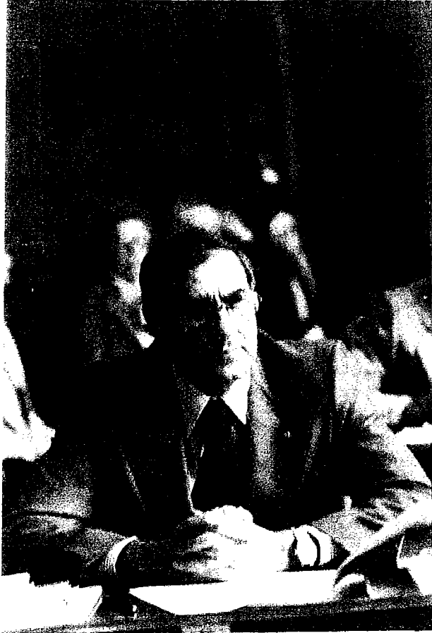
1988-- IN MY SEAT IN INDIANA HOUSE OF REPRESENTATIVES