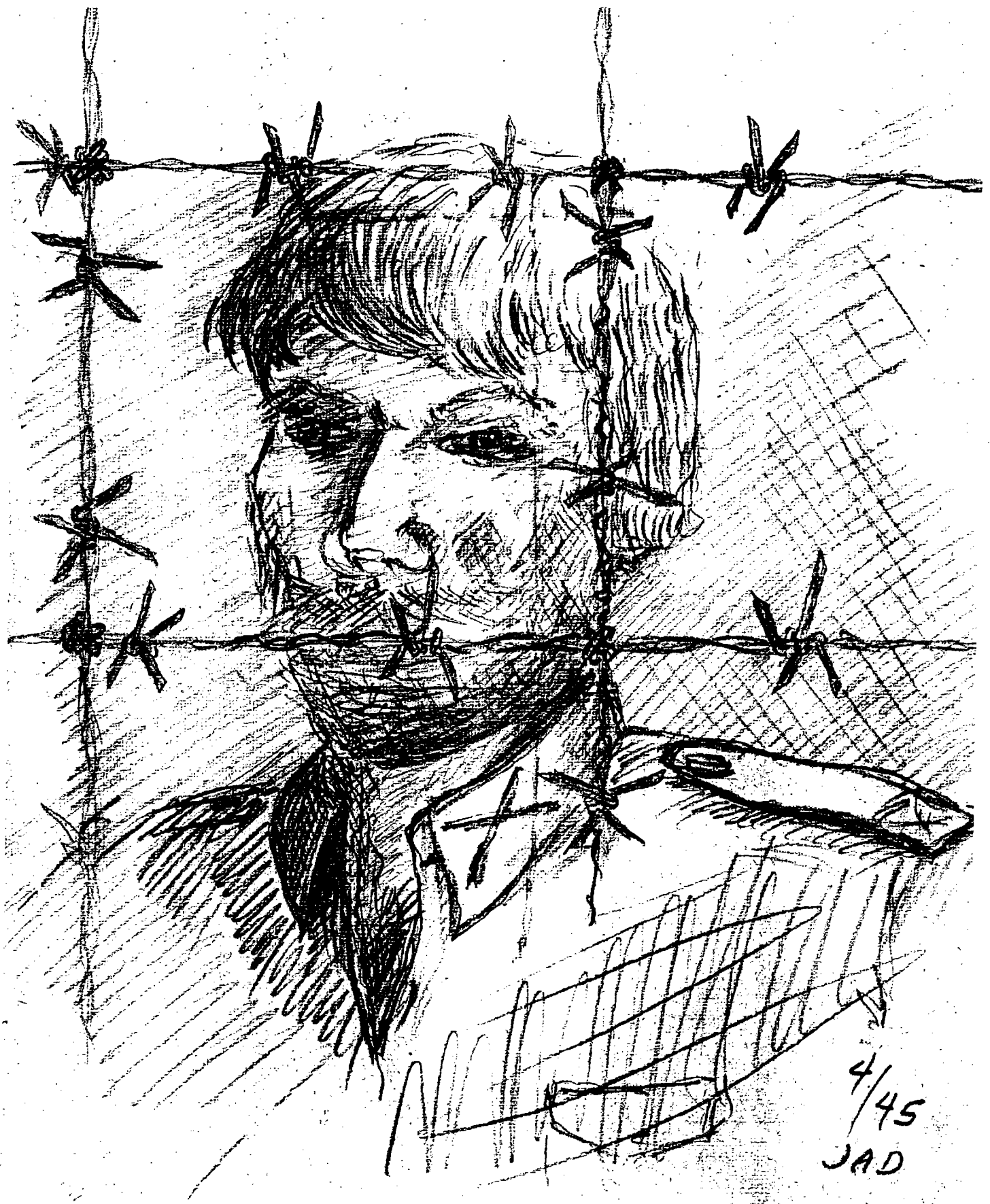
This sketch ,and the following 2 more, were drawn by Jay Drake, a POW at Oflag 64 and XIII B. This sketch is of a friend of his, who I do not know, looking through the wire.